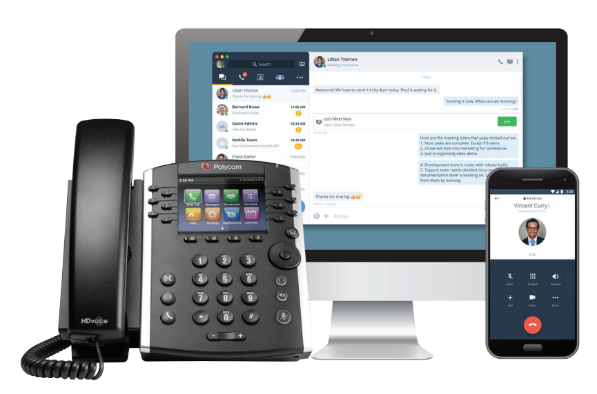
8x8 Virtual Office

All of this is delivered in the cloud, sets up in minutes and is easily managed from any device around the globe.