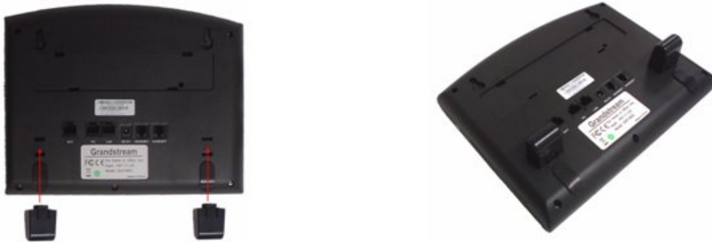
Figure 2: Attach the wall-mount spacers to the GXP-2010

To position the phone on the wall, place two fixed hangers on the wall, hang the back of the phone on the fixed hangers.