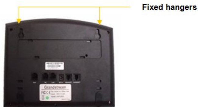
Figure 3: Location of the fixed hangers on GXP-2010

To use the handset, pull out the tab (extension downward) from the handset cradle, rotate the tab and plug it back into the slot with the extension up to hold the handset.