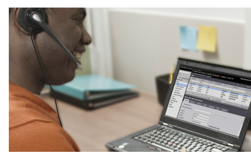
The browser-based Connect Director system management software uses radio buttons to easily set up account and feature permissions, eliminating redundant and time-consuming configurations.

Because Mitel streamlined provisioning, account setup, maintenance, and moves/adds/changes (MACs), IT will spend far less time managing your phones—saving your team time and bottom line. In fact, MiVoice Connect is so easy to administer that nontechnical employees can handle MACs in seconds.